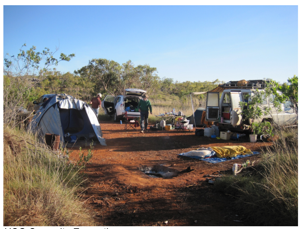
HCG Campsite Exmouth