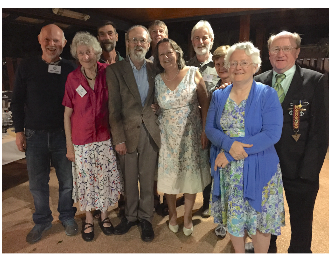
HCG members (past and present) at Ningaloo Underground